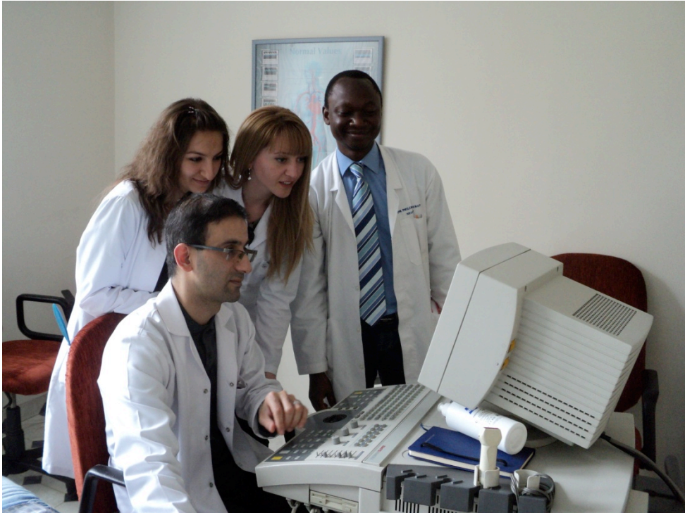
At the Carotid Doppler Laboratory with some residents