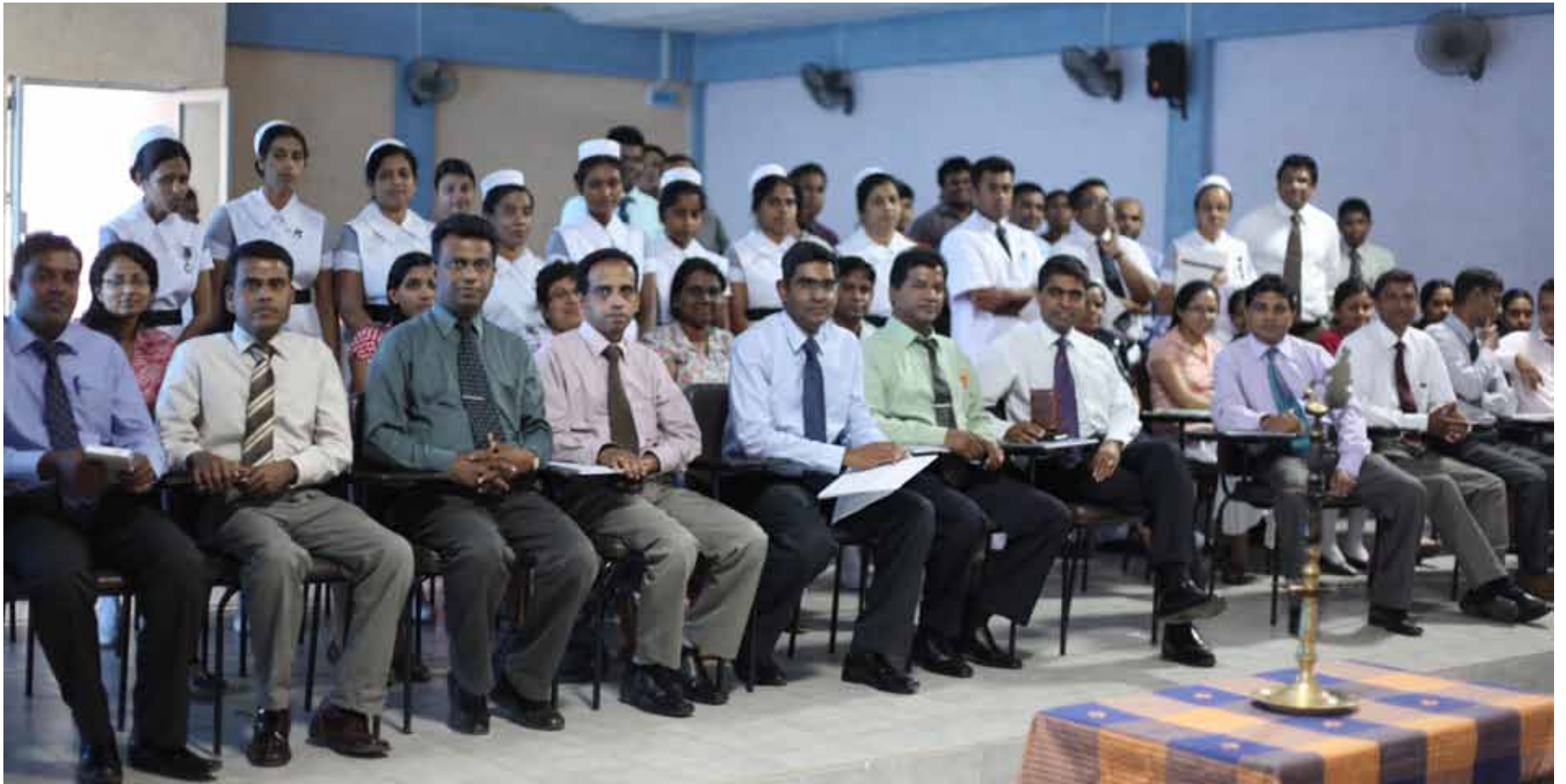
Diyatalawa Stroke Master Class audience.