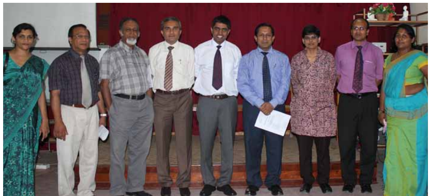
Stroke Master Class audience, Teaching hospital, Peradeniya.

This stroke master class series was the latest initiative of Asia Pacific Association of Young Neurologists and Trainees ( www.apaynet.org ), the Asia Pacific section of International Working Group of Young Neurologists and Trainees (IWGYNT), World Federation of Neurology. APAYNET was established in 2011 as a