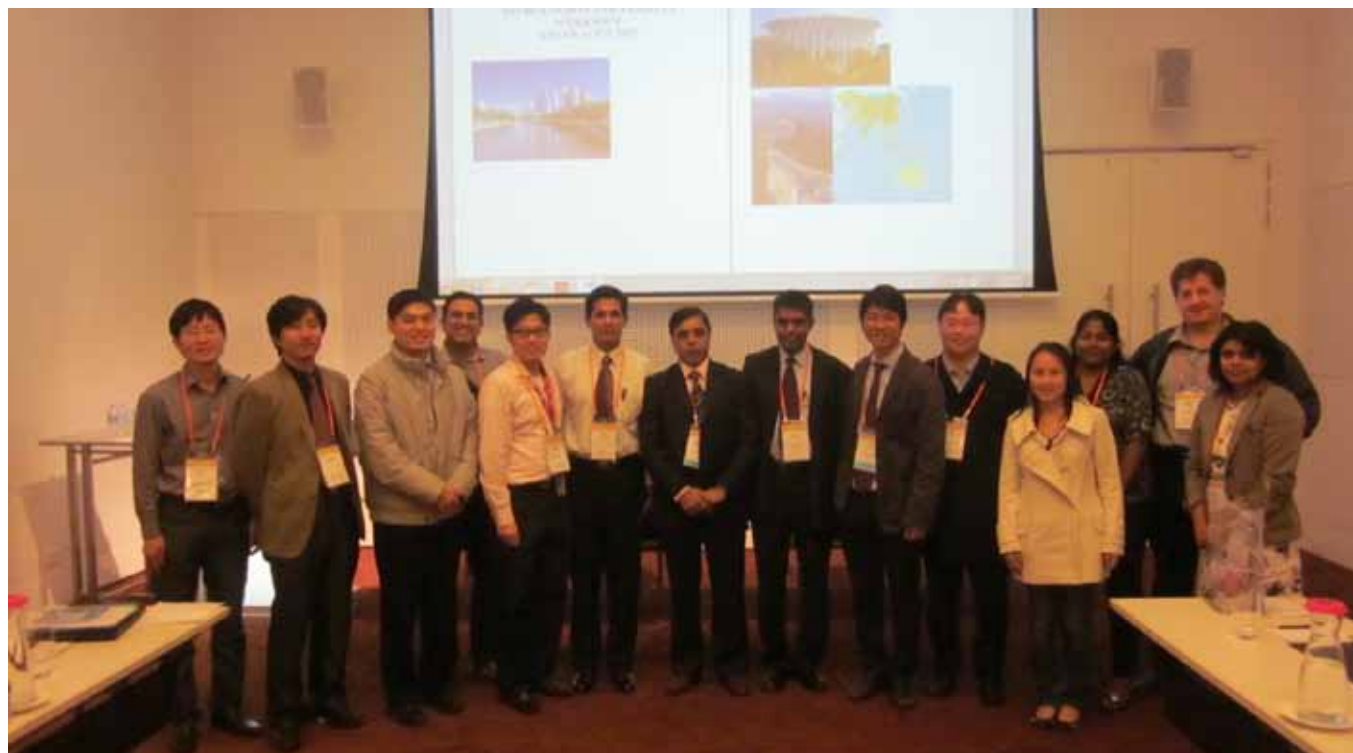
2012 APAYNET workshop participants in Melbourne, Australia.

training. Not all centers in Asia Pacific region have the necessary facilities to train young neurologists in their area of interest, so the trainee may have to spend time in another country. Our group will try their best