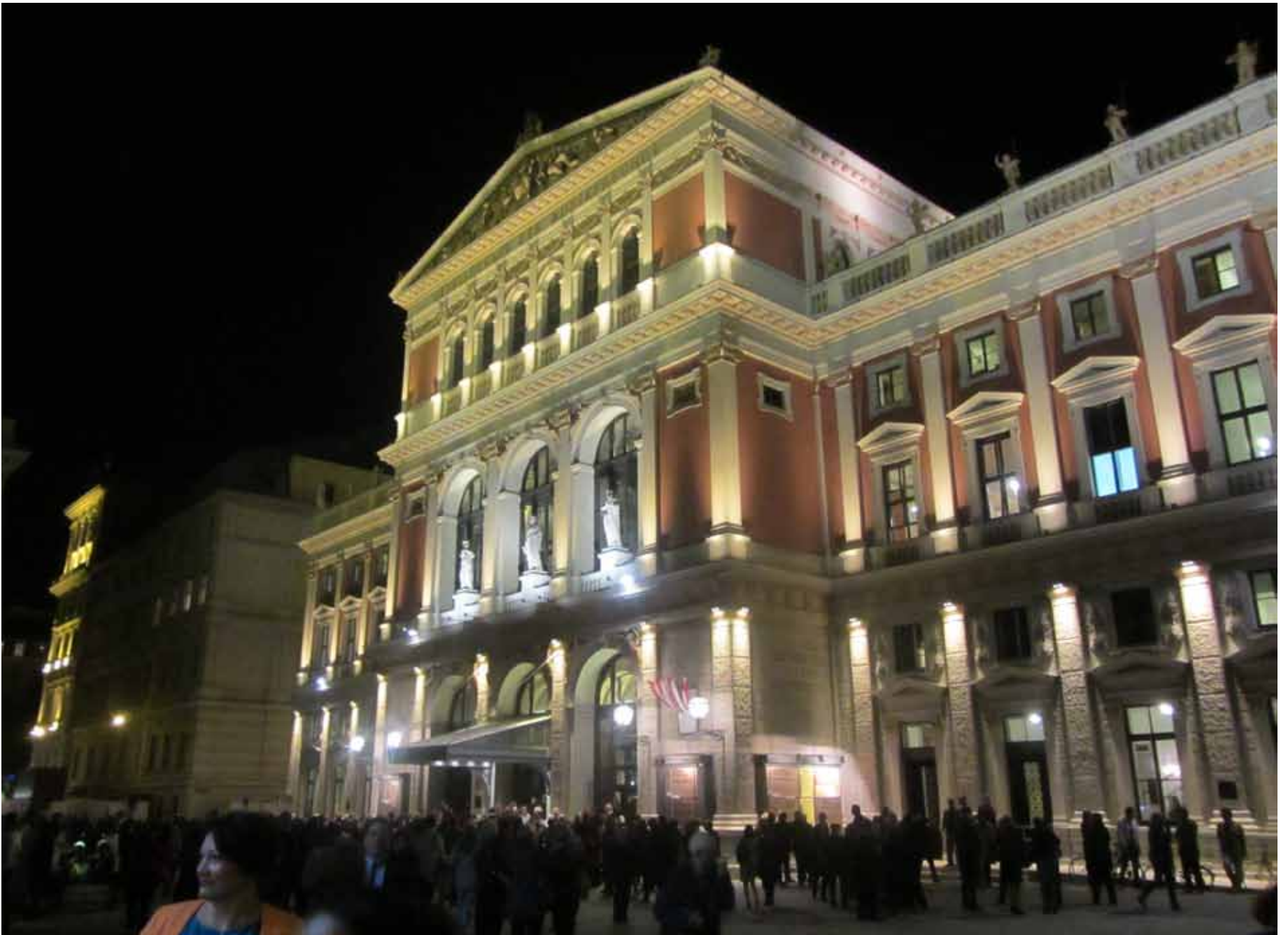
The Wiener Musikverein Concert Hall.