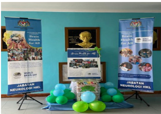
Display of banners, balloons, and pamphlets at the Tunku Abdul Rahman Neuroscience Institute.