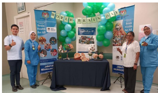
Display of World Brain Day corner at the Neurology Clinic, SCACC.