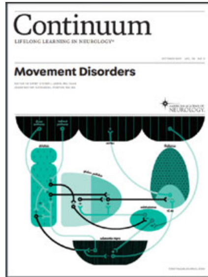
Cover of the upcoming Oct. 2022 Continuum issue.

Given the importance of Continuum in worldwide neurology education, and in particular the continued education of neurologists in low- and lower-middle-income countries, the WFN has now created a Continuum subcommittee of the Education Committee, consisting of members from