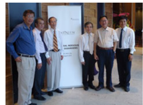
Ho Chi Minh City