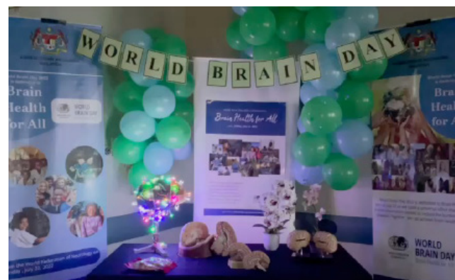
World Brain Day celebration with the neurology department staff.