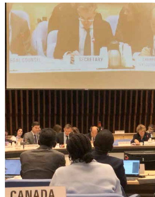
WHO Executive Board in session.