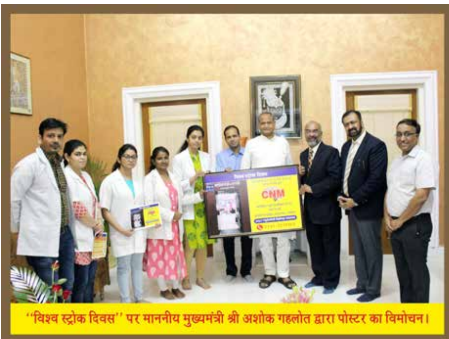
“विश्व स्ट्रोक दिवस” पर माननीय मुख्यमंत्री श्री अशोक गहलोत द्वारा पोस्टर का विमोचन।