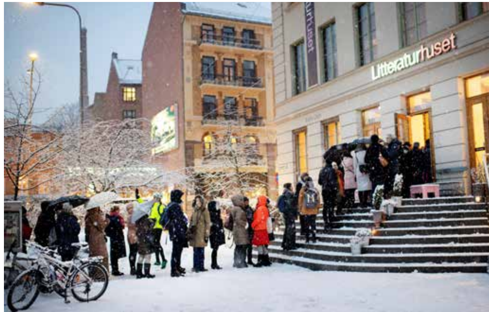
People waiting in a line to attend an open brain council meeting on sleep disturbances in Oslo.

policy of including mental disorders in brain disease.