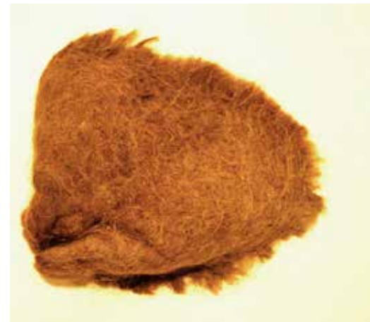
Figure 2. Plica polonica . Museum of the History of Lithuanian Medicine and Pharmacy.