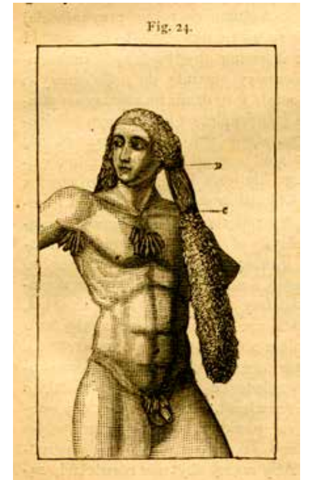
Figure 4. Depiction of plica polonica case in H. Dobrzycki's tractate, published in 1877. Vilnius University library, Rare Book department.

Today, we cannot find plica polonica in the International Classification of Diseases (ICD-10), and the phenomenon of plica could be explained by lack of hygiene, pediculosis, and pyoderma in the hairy parts of the body. However, until the end of the 19 th century in European cities, plica