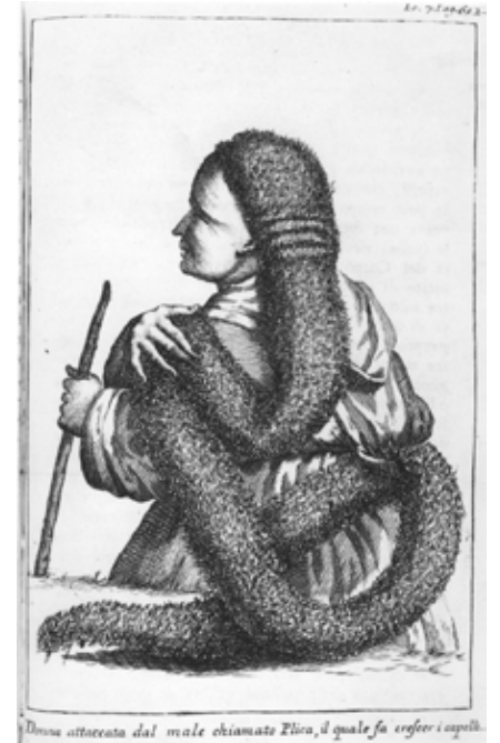
Figure 1. Depiction of plica polonica in Lo stato presente di tutti paesi, e popoli del mondo, naturale, politico, e morale by Thomas Salmon, 1739. Public domain.