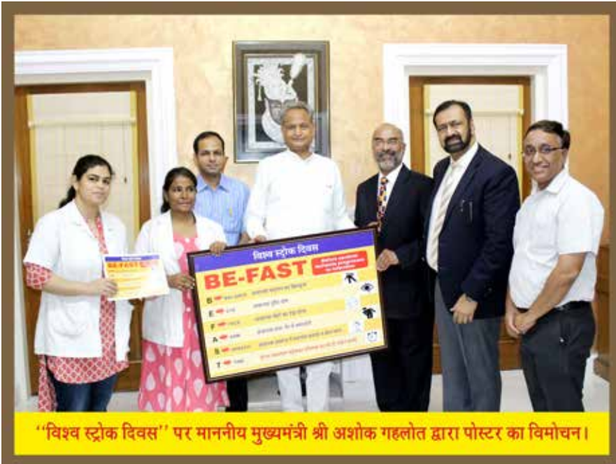
“विश्व स्ट्रोक दिवस” पर माननीय मुख्यमंत्री श्री अशोक गहलोत द्वारा पोस्टर का विमोचन।