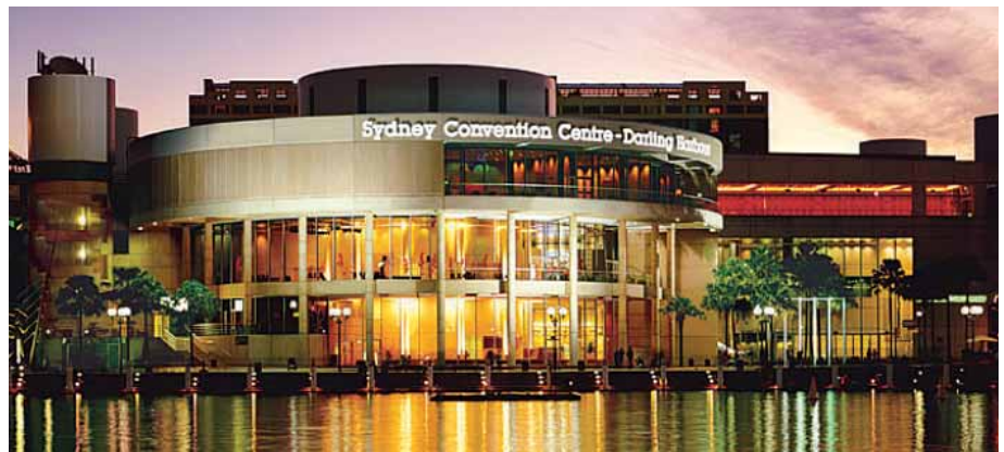
Destination Australia—Sydney Convention Centre, Darling Harbour

Registration: Registration is now open and available online via the Congress website or by submission of a hard copy registration form. If you wish to receive a hard copy of the registration