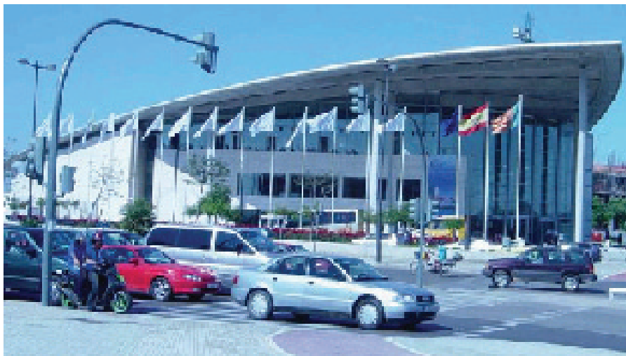
Convention Centre, 12th European Stroke Conference, Valencia

A systematic review of the risks of carotid endarterectomy by R. Bond et al. (UK) showed that the risk of carotid endarterectomy is highest after hemispheric ischaemia, less so in asymptomatic stenosis, and lowest for patients with ocular ischaemia.