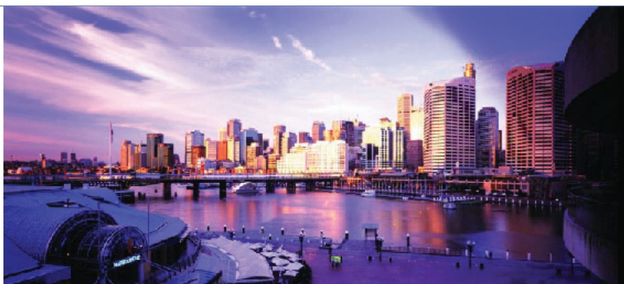
Destination Australia — XVIIIth World Congress of Neurology, Sydney, 2005.