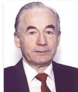
Johan A. Aarli President WFN

The vastness of the African continent means the endeavours of the WFN will have to be limited. The first year of the WFN Africa programme has established parts of an infrastructure for further work, but professional awareness of public health aspects of neurological disorders needs to be raised. One important task is to reach key people of strategic influence connected with administrative government positions. We hope to approach this goal by an interplay between WFN, the Africa Committee and the international health organizations.