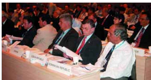
Council of Delegates