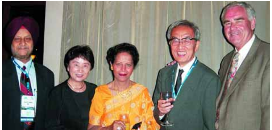
Presidential Reception, held on November 7, 2005

As a consequence of the high standard of topical thematic issues, there was an intense media interest in the Congress, which enabled neurology in general and a number of specific topics to be exhibited to the broader community. Each day press conferences targeted diseases such as epilepsy, multiple scler-