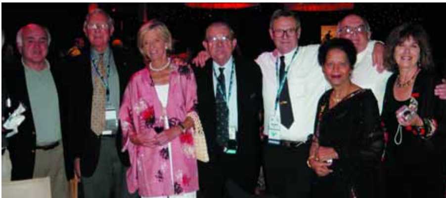
Congress Dinner on November 9, 2005