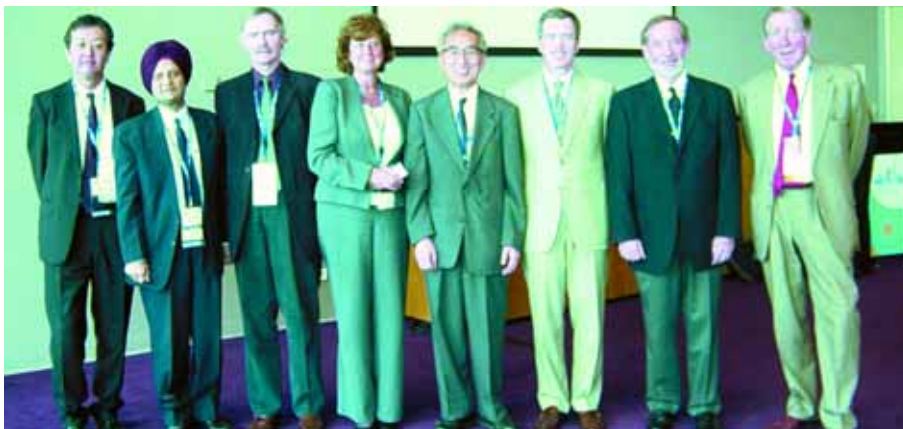
Meeting of the WFN Structure and Function Committee held at Sydney during WCN in November 2005.